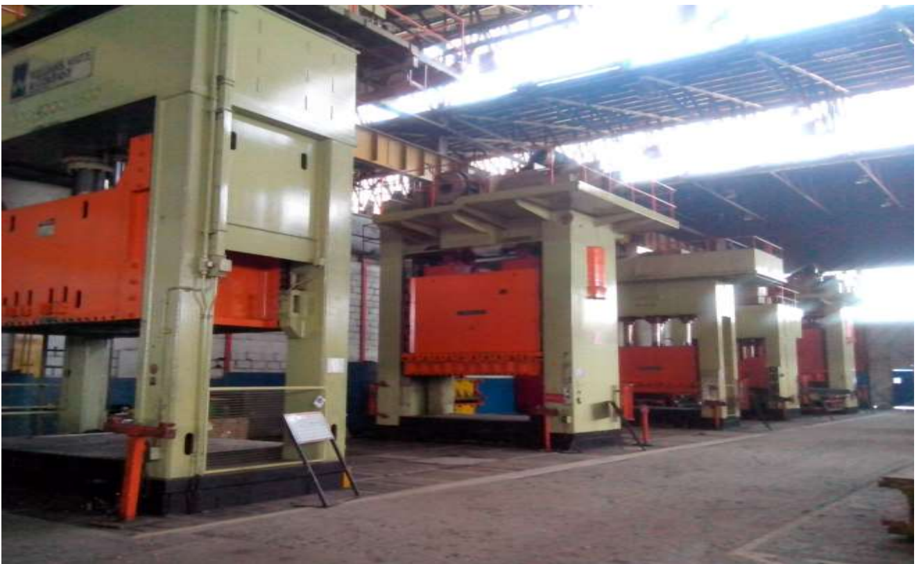
Picture 10 Heavy Tonnage Press Machines