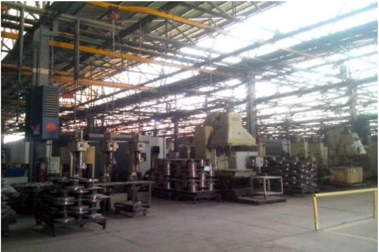
Picture 11 Machining Manufacturing Workshop