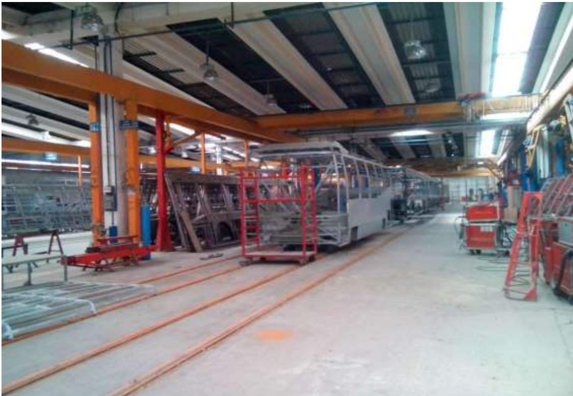
Picture 4 Bus Assembly Line 1