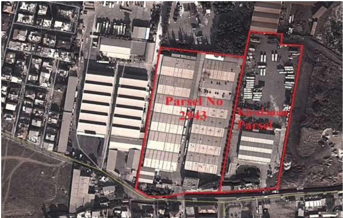
Picture 3 Satellite Image of Bus Manufacturing Building