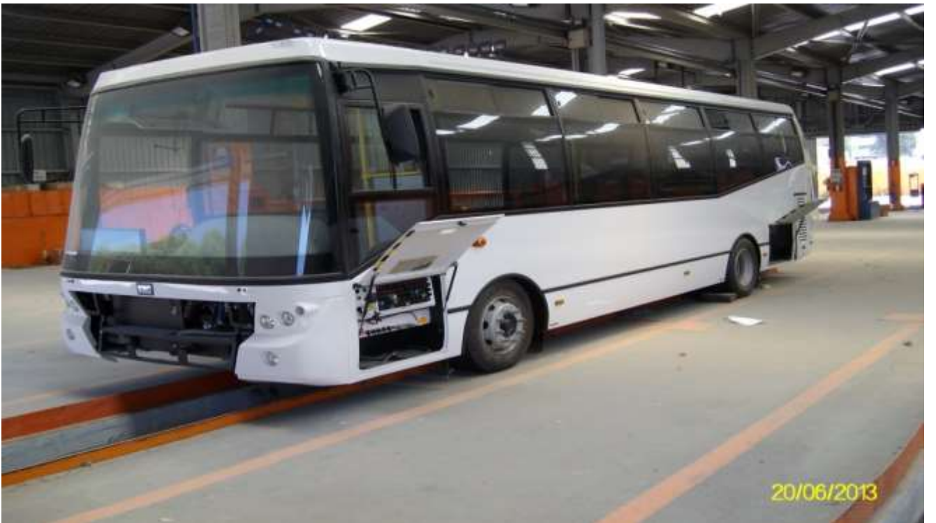
Picture 6 Bus Assembly Line 3