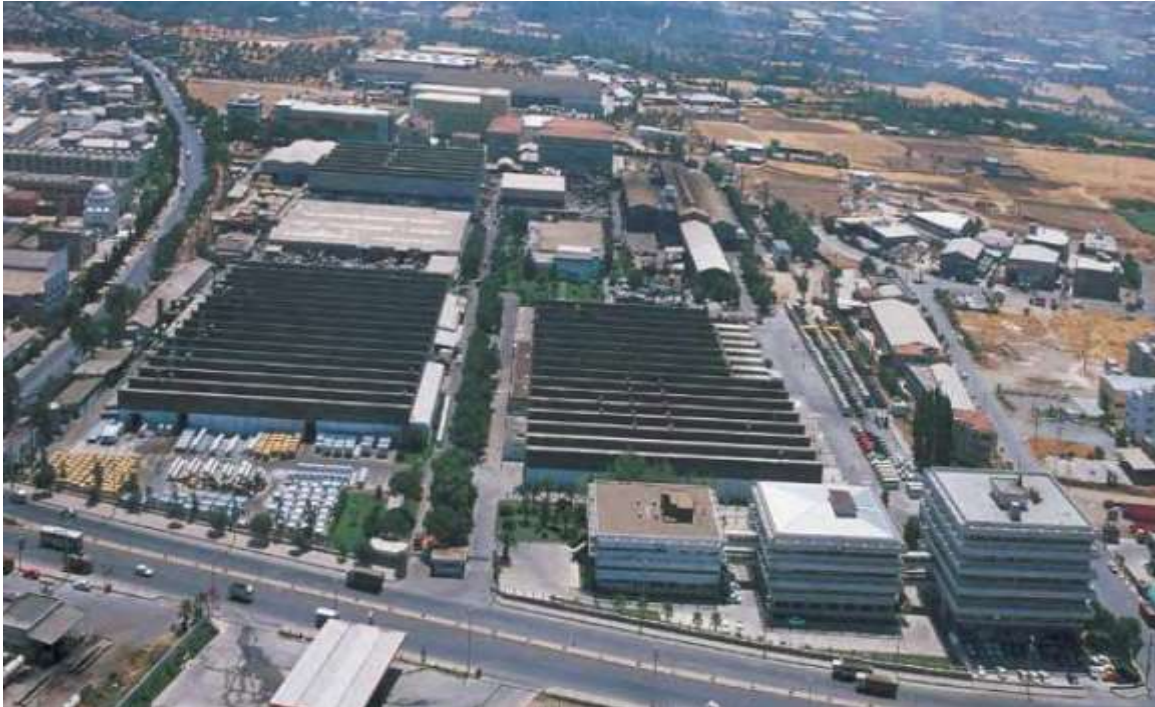
Picture 2 Main Factory Buildings