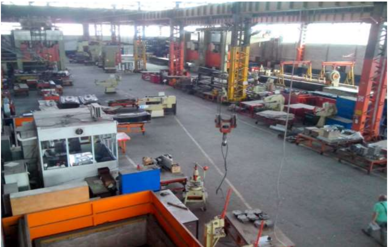
Picture 8 Press Workshop