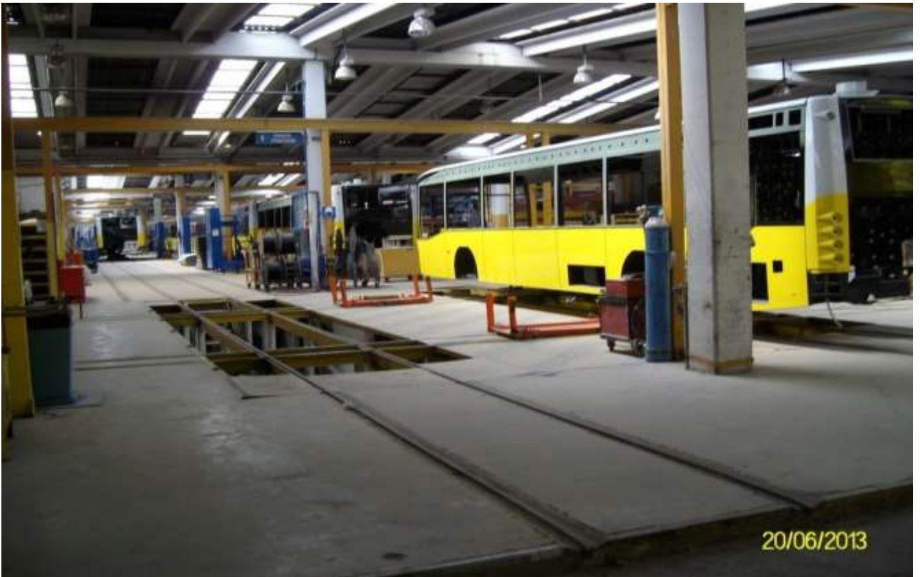
Picture 5 Bus Assembly Line 2