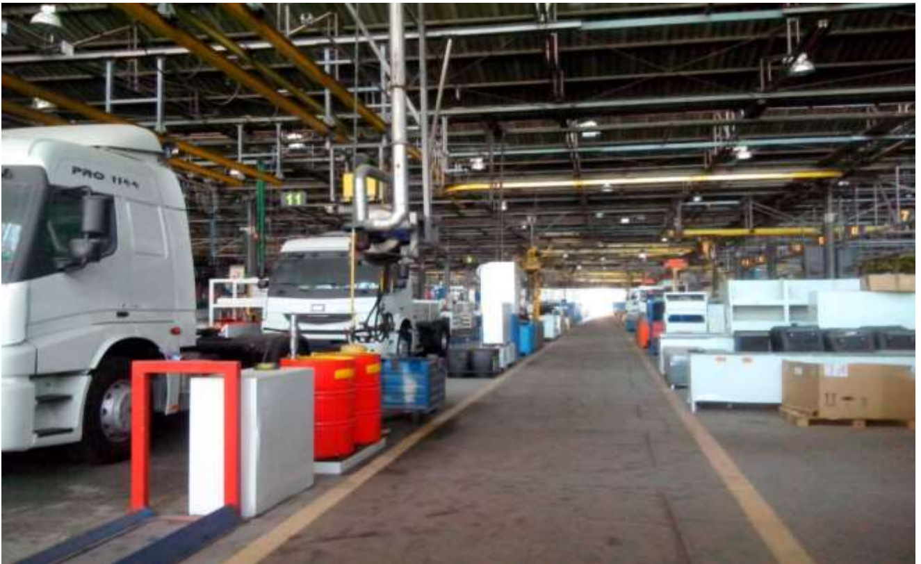
Picture 7 Heavy Commercial Vehicle Assembly Line