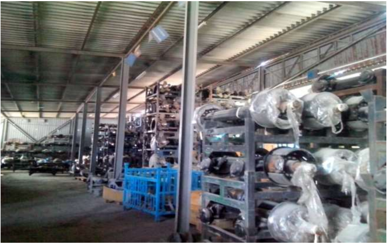
Picture 9 Heavy Commercial Vehicle Axles