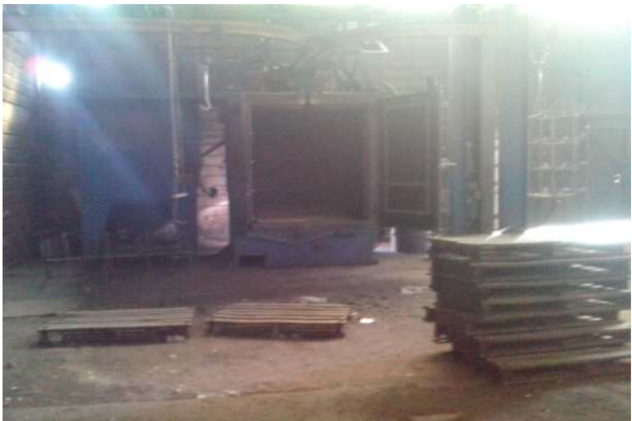
Picture 12 Casting Induction Furnace