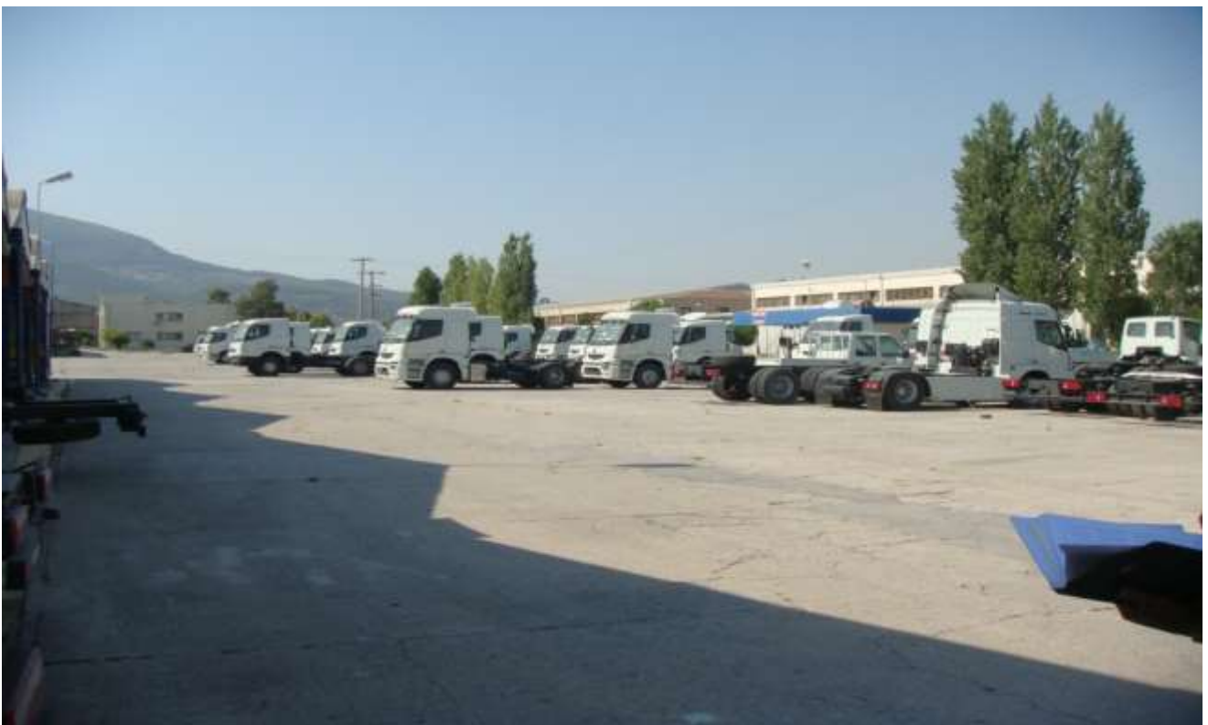
Picture 14 Storage Area for Finished Products