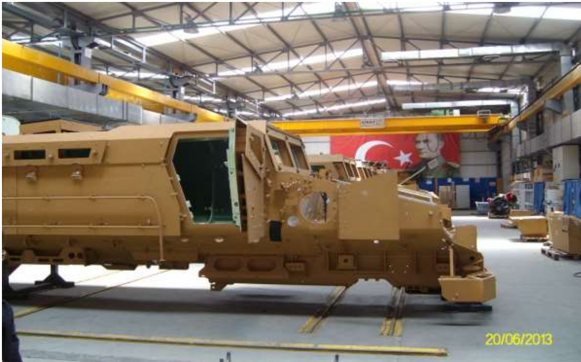
Picture 14 Manufacturing Division for Armored Vehicle Kirpi (Hedgehog)