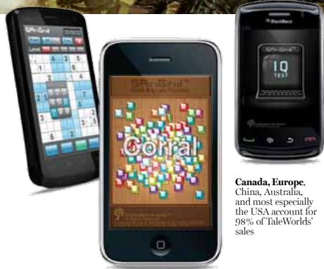
Canada, Europe, China, Australia, and most especially the USA account for 98% of TaleWorlds' sales

The first company that contacted TUDOF for this purpose was Riot Games, which holds the rights to League of Legends, one of the world's most popular games. The company, which opened an office in Turkey in